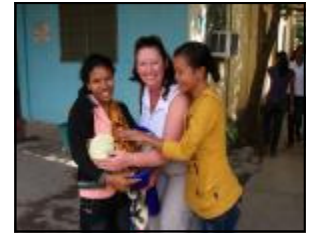
A trip to a local hospital in East Timor

To get involved call the parish office 3264 8283 OR email murriministry@bne.catholic.net.au