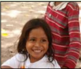
They have very little and yet look at the smile—Atauro Island

Meets—3rd Monday of each month in the Parish Centre