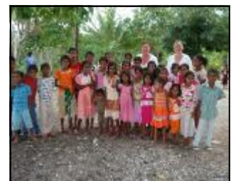
Putting on their Sunday best for Mass in Macadade (highest village on Atauro Island – East Timor

To get involved call Parish Office for contact details